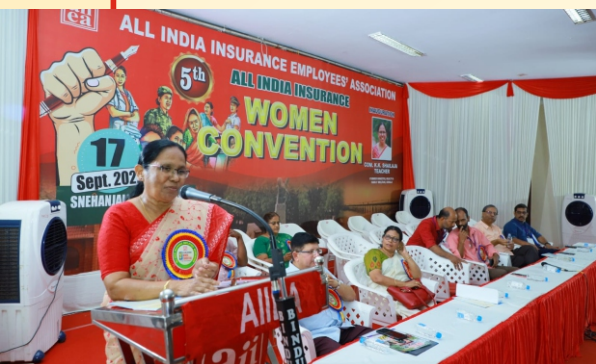
Inauguration KK SHYLAGA TEACHER

quarantine, test, isolate and treat' because the Primary Health Centres (PHCs) in the State were working under the Panchayats even though they were under the Health Department. She explained that the synergy generated by integrating state government plans and programmes with the local governments, co-operatives, women neighbourhood groups (Kudumbashree) and civil society organisations worked wonders during the pandemic. She was categorical that it is due to these synergies that Kerala stands out as the most prosperous state in India in terms of basic human development indices like infant mortality rate, literacy rate and gender justice. She urged the women comrades of AIIEA to contribute their mite to improving the lot of women in Indian society apart from contributing to the struggle of the trade union.