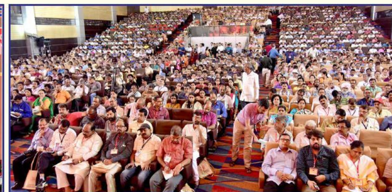
Section of Audience