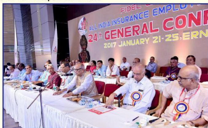
Com. C.S. Bose