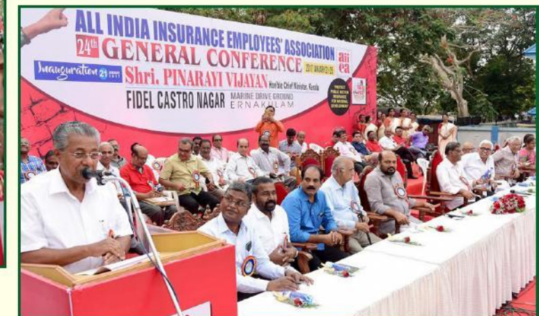
Inaugural Address by Com.Pinarayi Vijayan Hon'ble Chief Minister Kerala