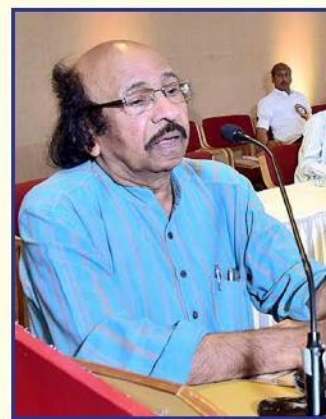
Prof. K. Satchidanandan